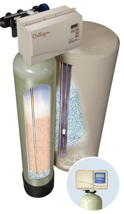
Culligan Medallist Series® outdoor model shown